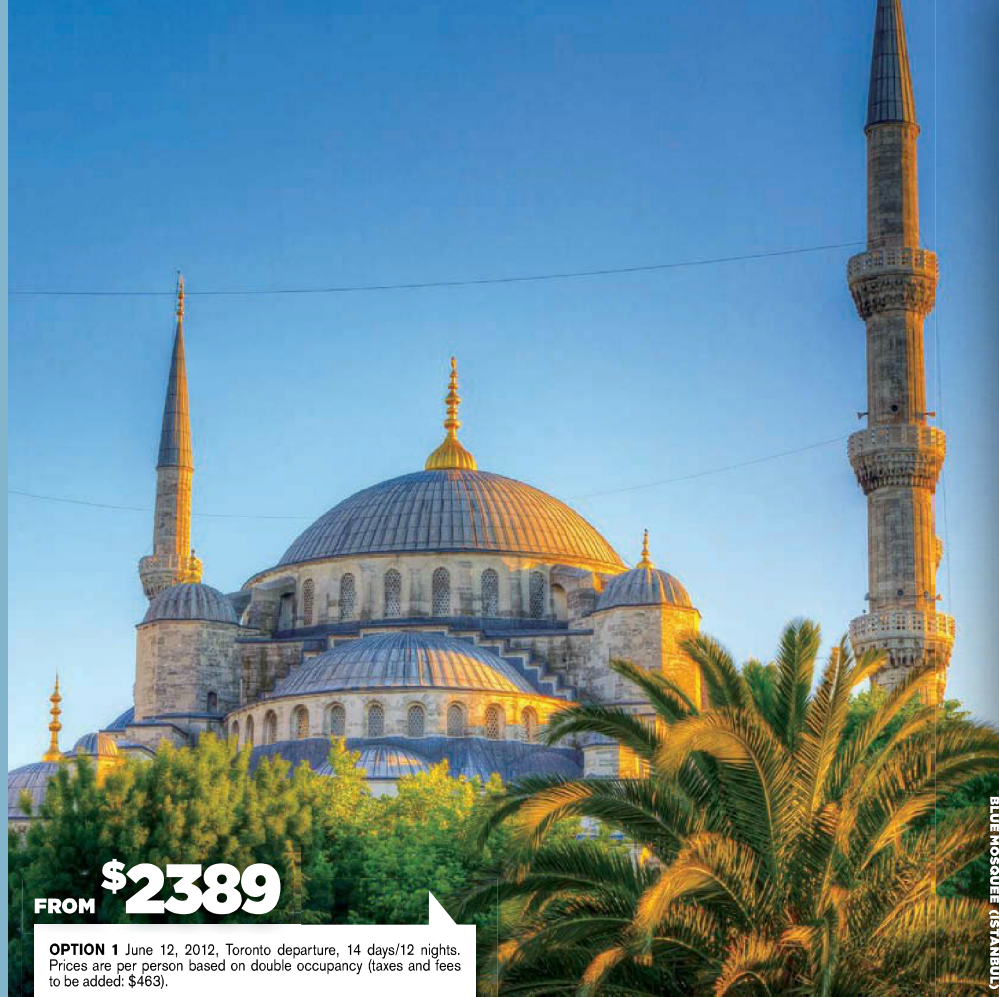
BLUE MOSQUE (ISTANBUL)